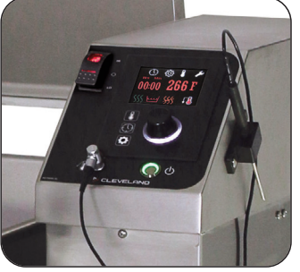
easyDial and Core Temperature Probe options